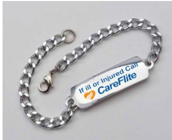
Medical Bracelets $10 each