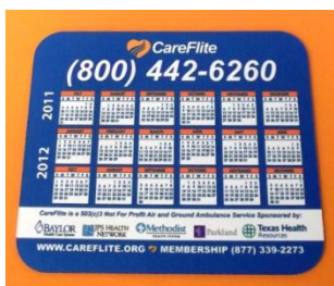
2011-2012 Calendar Mousepad