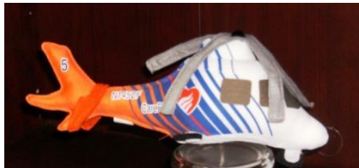
Stuffed CareFlite Helicopter $14.99 each.