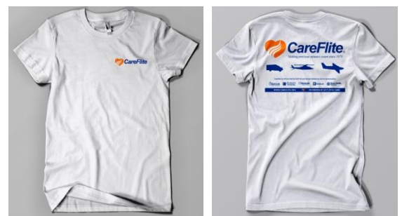
Short Sleeve T Shirts (shown front & back) $9.99 in Medium, Large, XL, 2XL