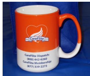
Coffee Mug Est.1979 $4.99