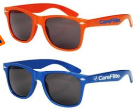
Orange or Blue Sunglasses $4.99 each