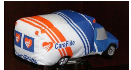
Stuffed CareFlite Ambulance $14.99