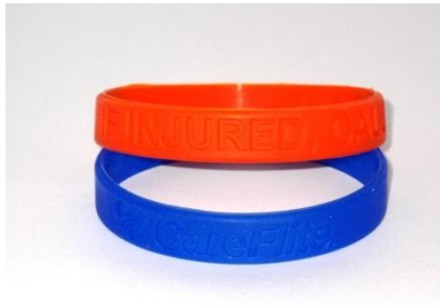
Silicone Bracelets – Free