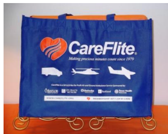
Cloth Tote Bag $4.99 each