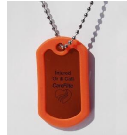
Orange Dog Tags $2 each/3 for $5