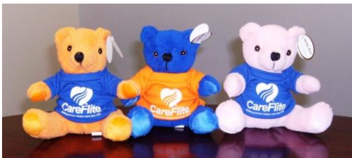
CareFlite Bears $9.99 each or 2 for $15