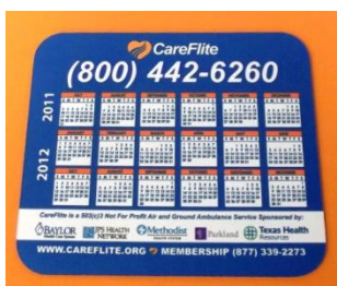
2011-2012 Calendar Mousepad Cloth Tote Bag $4.99 each