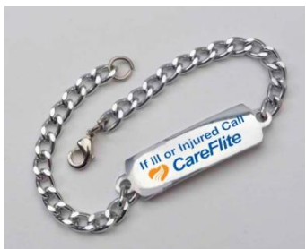
Medical Bracelets $10 each