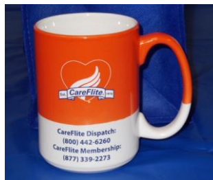
Coffee Mug Est.1979 $4.99