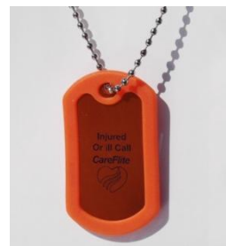
Orange Dog Tags $2 each/3 for $5