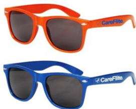
Orange or Blue Sunglasses $4.99 each