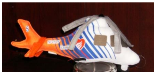
Stuffed CareFlite Helicopter $14.99 each.