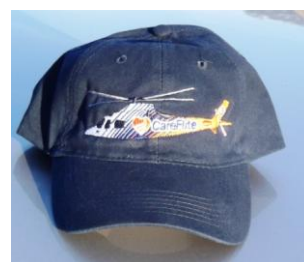
Blue Helicopter Hat $9.99

Order these items and more at http://www.careflite.org/heartshop.aspx or call (877) 339-2273