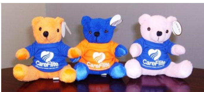
CareFlite Bears $9.99 each or 2 for $15