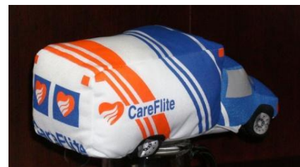
Stuffed CareFlite Ambulance $14.99