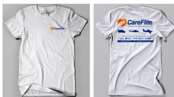
Short Sleeve T Shirts (shown front & back) $9.99 in Medium, Large, XL, 2XL