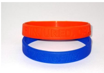
Silicone Bracelets – Free